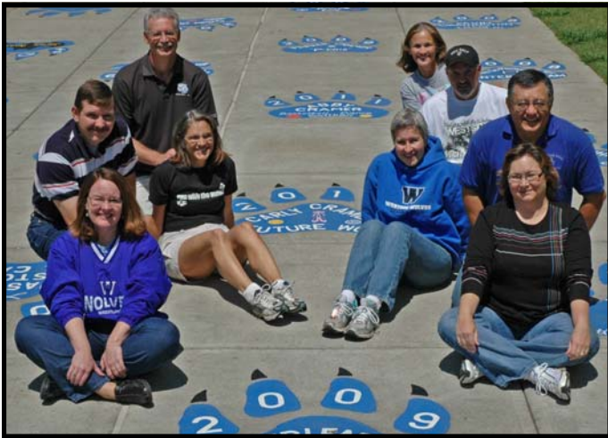
5 Westside Senior Athletic Booster Club Families Graduate